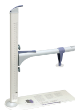
CompressAR Model 6000 StrongArm Stand

Suitable for Universal Stand. The Oval Comfort can be used for slender patients and is available in one size only.