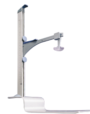
CompressAR 1200 TotalCare StrongArm Stand Designed for use on Hill-Rom TotalCare Beds

Upgrade Kits also available to upgrade your Universal Stand to a StrongArm (180-000600).